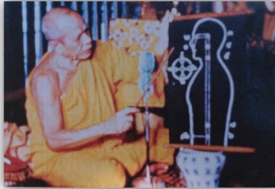
Luang Phor Sodh while demonstrating the path to the center of the body

The Late Abbot of Wat Paknam Bhasicharoen